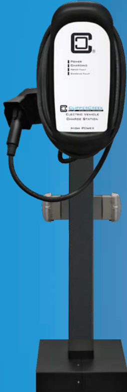
Single-Mount Pedestal w/convenience outlets