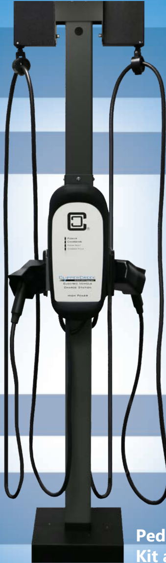
Pedestal with Dual-Mount Kit and Extension Kit

RUGGED, CONVENIENT INSTALLATION. ClipperCreek offers a variety of mounting options for the HCS charging station product line. Mount 1-4 stations on a pedestal with optional kits; Keep cables neat and safely off the ground with an extension kit. ClipperCreek's mounting solutions suit all commercial HCS installation needs at an affordable price.