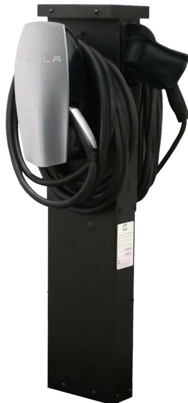
HCS/TESLA® Combo PMD-10T

The PMD-10T has all the same features as the PMD-10, but comes equipped to mount ClipperCreek and/or Tesla® 2nd Generation charging stations. Available for just $568 .