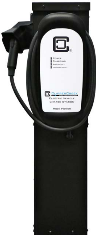
PMD-10R with HCS -60

The PMD-10R is an affordable solution designed for fleet, parking lot, or any harsh environment. Designed to accommodate ClipperCreek HCS, LCS, ACS products as well as the Tesla® Wall Connector. This "ruggedized" mounting solution is an excellent value at $829 .